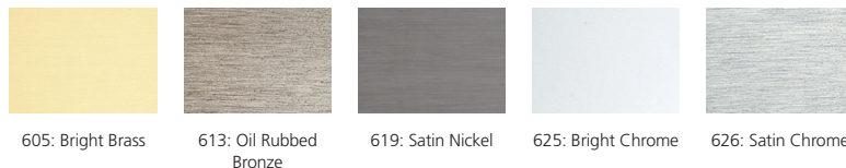
605: Bright Brass 613: Oil Rubbed Bronze 619: Satin Nickel 625: Bright Chrome 626: Satin Chrome