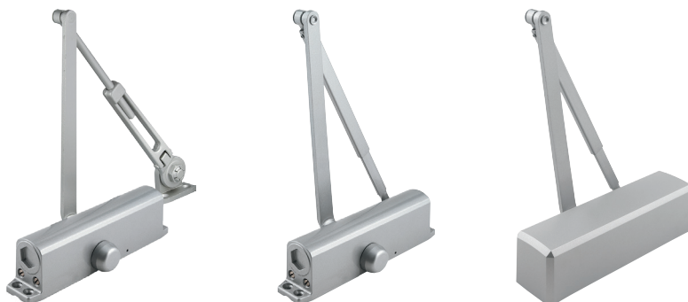
696: Painted Satin Brass