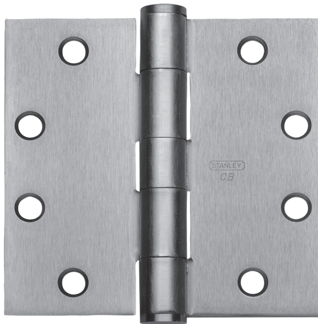
5 Knuckle CB Hinge