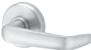
Lever-15 Rose - H