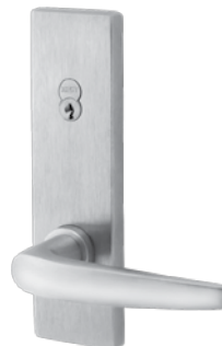
Lever-16 Escutcheon - M