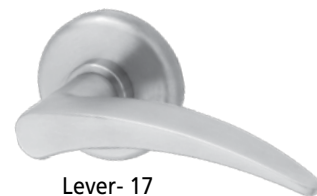
Lever-17 Rose - H