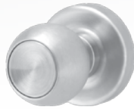
Knob-4 Rose - R