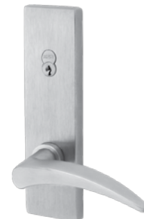
Lever-17 Escutcheon - N