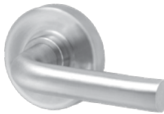
Lever-12 Rose - R