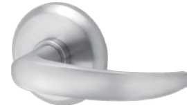
Lever-14 Rose - S