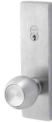
Knob-4 Escutcheon - N