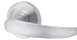
Lever-14 Rose - R