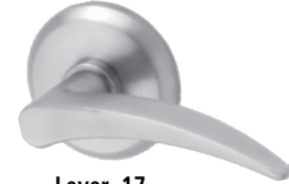
Lever-17 Rose - S