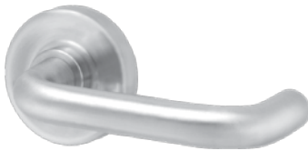
Lever-3 Rose - R