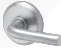
Lever-12 Rose - S