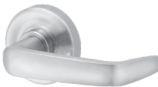
Lever-15 Rose - R