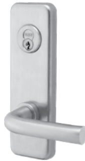
Lever-12 Escutcheon - J