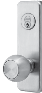
Knob-4 Escutcheon - J