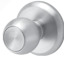
Knob-4 Rose - S