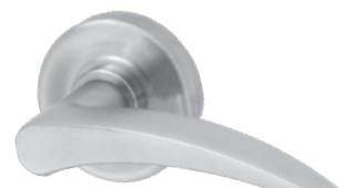
Lever-17 Rose - R