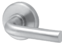
Lever-12 Rose - H