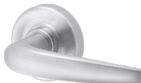
Lever-16 Rose - R