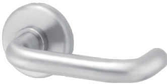
Lever-3 Rose - H