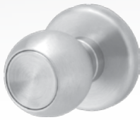
Knob-4 Rose - H