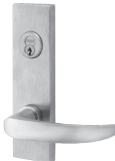
Lever-14 Escutcheon - J