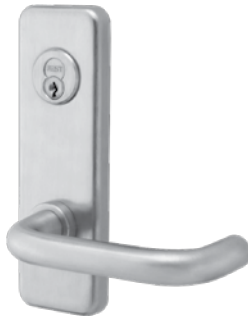
Lever-3 Escutcheon - J