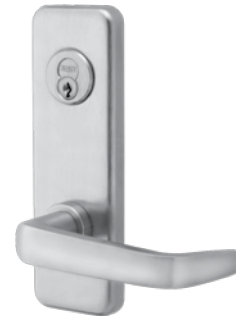
Lever-15 Escutcheon - J