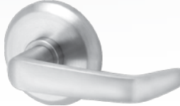
Lever-15 Rose - S