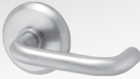
Lever-3 Rose - S