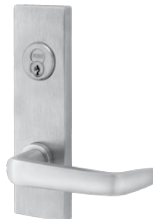
Lever-15 Escutcheon - J