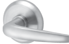
Lever-16 Rose - S