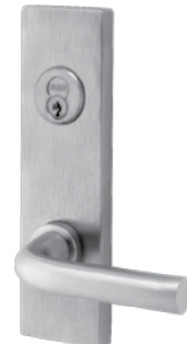
Lever-12 Escutcheon - M