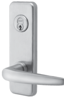
Lever-16 Escutcheon - J