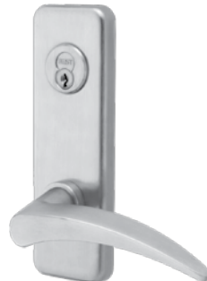
Lever-17 Escutcheon - J