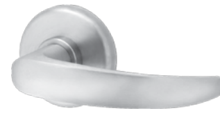
Lever-14 Rose - H