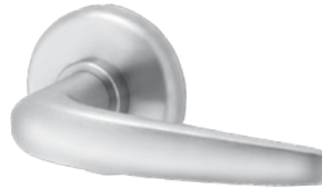
Lever-16 Rose - H