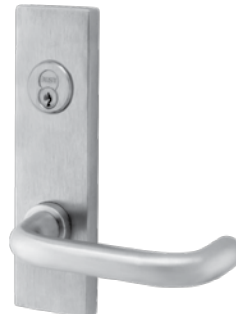
Lever-3 Escutcheon - M