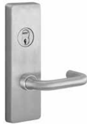
4900D "D" Lever