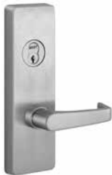
4900A "A" Lever