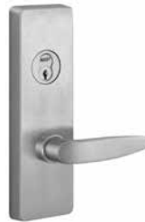
4900B "B" Lever